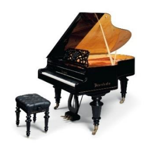
Property from the Collection of Sir David and Lady Tang An Austrian Ebonised and Brass-Inlaid Baby Grand Piano by Bosendorfer, circa 1960 £2,000-3,000